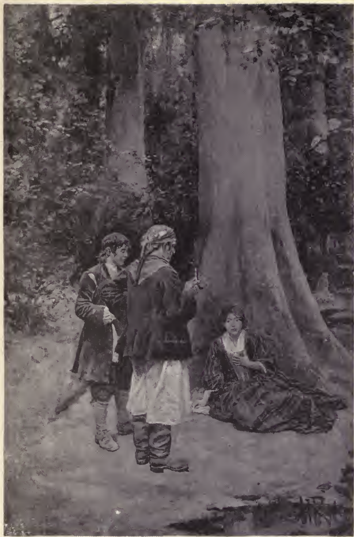
"THEY FOUND HER STILL SITTING IN THE SAME PLACE."